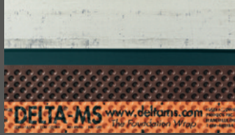
DELTA®-FLASH angled flashing used at top of flat tab.