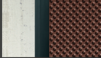
DELTA®-MOLDSTRIP molding used around window cut-outs and at grade level/changes.