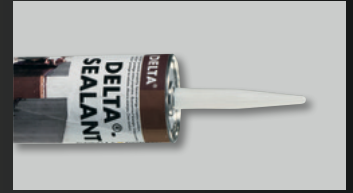
DELTA®-SEALANT elastic sealing compound used at overlaps and penetrations.

DELTA® is a registered trademark of Ewald Dörken AG, Herdecke, Germany.